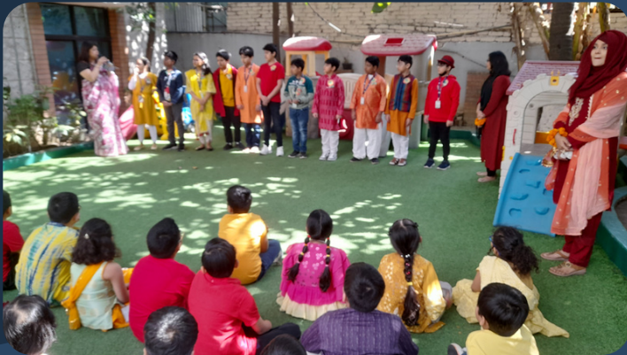
International Mother Language Day

We are delighted to update you on the progress of our Primary 2 students throughout Term 3. This term has been full of enriching experiences and engaging lessons that have helped our students grow both academically and personally.