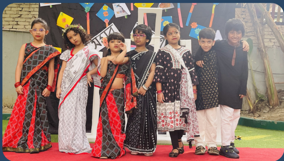
International Mother Language Day

All the students and teachers gathered and participated in different songs and folk dances, offered flowers to the Shahid Minar, and wore black and white on the International Mother Language Day to pay homage to the martyrs. The celebration of the Pohela Falgun was another event during the term to remember and cherish. Besides, SSK celebrated Independence Day with an Art competition and a small cultural performance by the primary students. In celebration of Sheikh Mujibur Rahman's (Father of the Nation) Birthday, SSK students watched a documentary on his life and mission and Primary students from the Recitation Club recited a beautiful poem on the occasion.