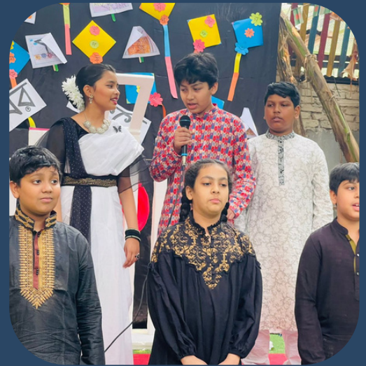
International Mother Language Day.