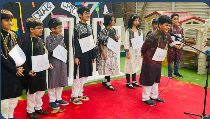
International Mother Language Day

"If we had no winter, the spring would not be so pleasant: if we did not sometimes taste adversity, prosperity would not be so welcome."